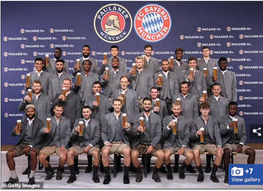
The Bayern Munich squad held their lederhosen photoshoot but Harry Kane was absent